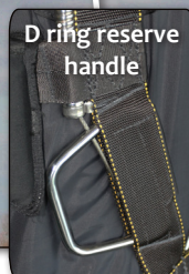
D ring reserve handle