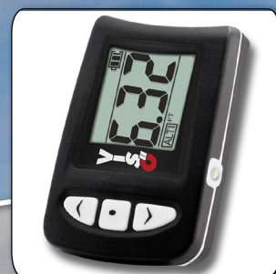
State-of-the-art Altitrack freefall altimeter/computer or Larsen & Brusgaard Viso digital altimeters