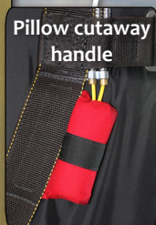
Pillow cutaway handle