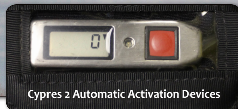
Cypres 2 Automatic Activation Devices

Top-of-the-line Javelin Odyssey and Aerodyne Icon containers have safety features including reserve static lines and Cypres 2 Automatic Activation Devices. Hackey main deployment handles are located on the bottom of the container.